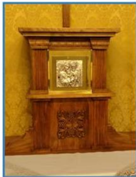
Salve Regina Newman Center