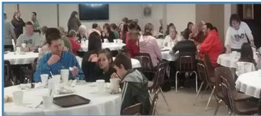
St. Luke, Eureka Soup Supper