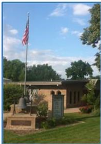
St. Joseph, Roanoke

Calendar changes should be emailed to saintluke.eureka@gmail.com