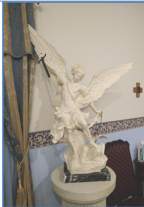
Salve Regina Newman Center