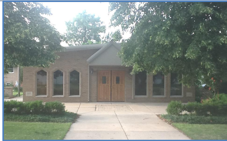
St. Joseph, Roanoke

Calendar changes should be emailed to saintluke.eureka@gmail.com