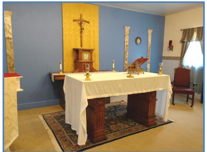
St. Luke, Eureka