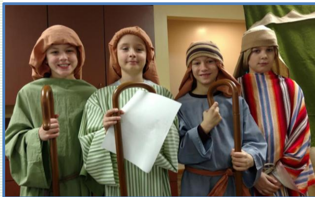
St. Luke Christmas Program