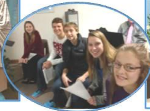
Confirmation Class Narrators