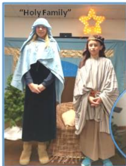
St. Luke Christmas Program

Calendar changes should be emailed to saintluke.eureka@gmail.com