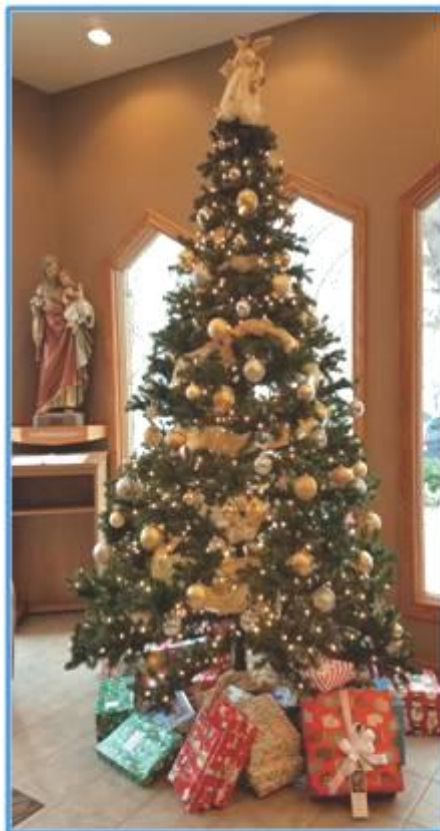
St. Joseph, Roanoke