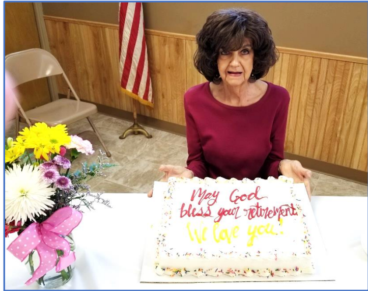
St. Joseph, Roanoke

Bulletin announcements and calendar changes should be typed and submitted to the St. Luke office or emailed to saintluke.eureka@gmail.com by Monday.