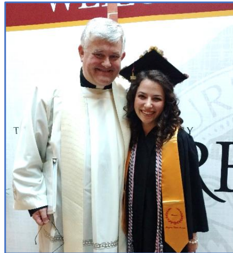
Salve Regina Newman Center