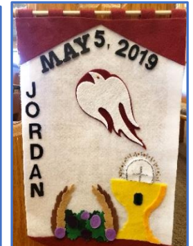
St. Luke, Eureka First Communion Banners