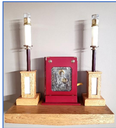
St. Joseph, Roanoke