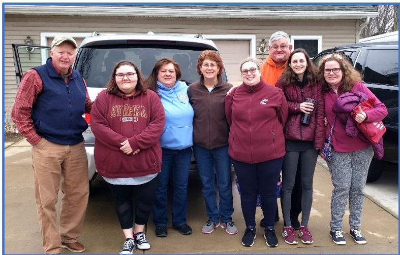
Salve Regina Newman Center