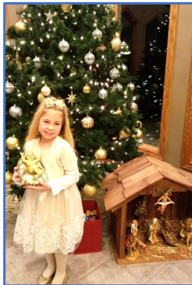
St. Joseph, Roanoke

An Outreach of... St. Luke's Catholic Church 904 E. Reagan Drive Eureka, IL 61530 (309) 467-4855