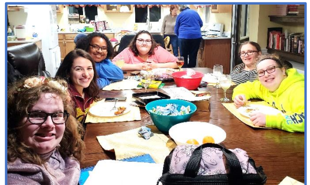
Salve Regina Newman Center