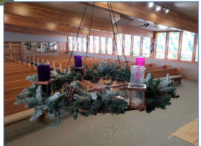
St. Joseph, Roanoke