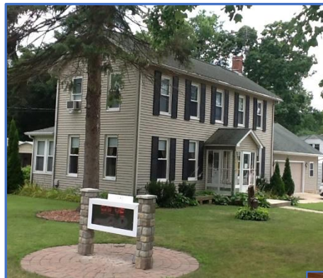
Salve Regina Newman Center