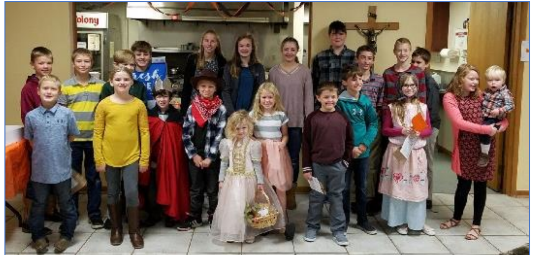
All Saints Party

Calendar changes should be emailed to saintluke.eureka@gmail.com