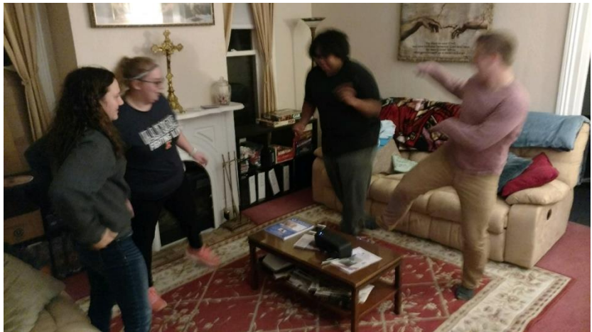
Cutting A Rug At The Newman Center